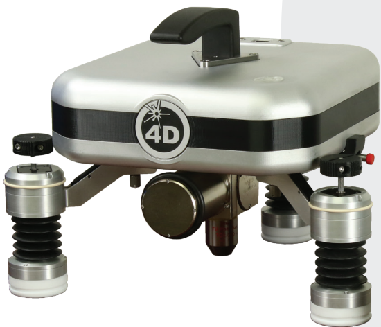
NanoCam HD with optional tripod

Utilizing a Linnik configuration, NanoCam HD interference objectives provide superior lateral resolution over a larger field of view with greater working distance and surface measurement fidelity than comparable Mirau objectives.