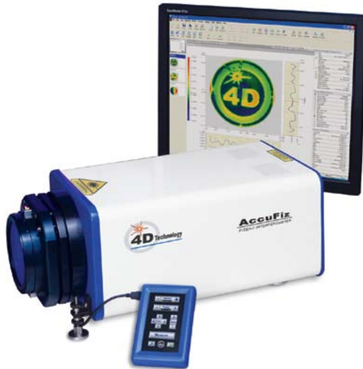
Figure 2. 4D Technology's AccuFiz Interferometer with dynamic measurement option.

4D Technology was ultimately selected as the vendor to provide the interferometer. According to Poczulp, 4D's AccuFiz® interferometer (Figure 2) was selected because of its small size, which allows the instrument to be moved easily between test stations and facilities, and the flexibility of its software, which would enable the system to be used for a range of future measurement work as well as for the current projects at the facility. The interferometer also gave the shop significantly improved resolution and precision compared with its older, traditional measurement equipment.